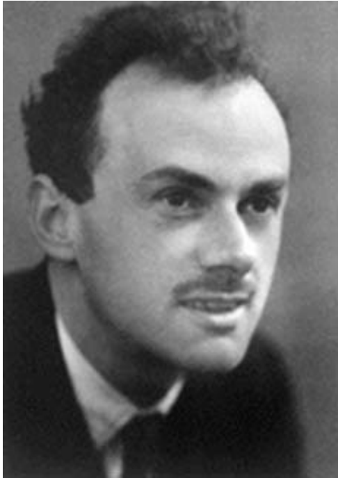
Paul Adrien Maurice Dirac (1902-1984)