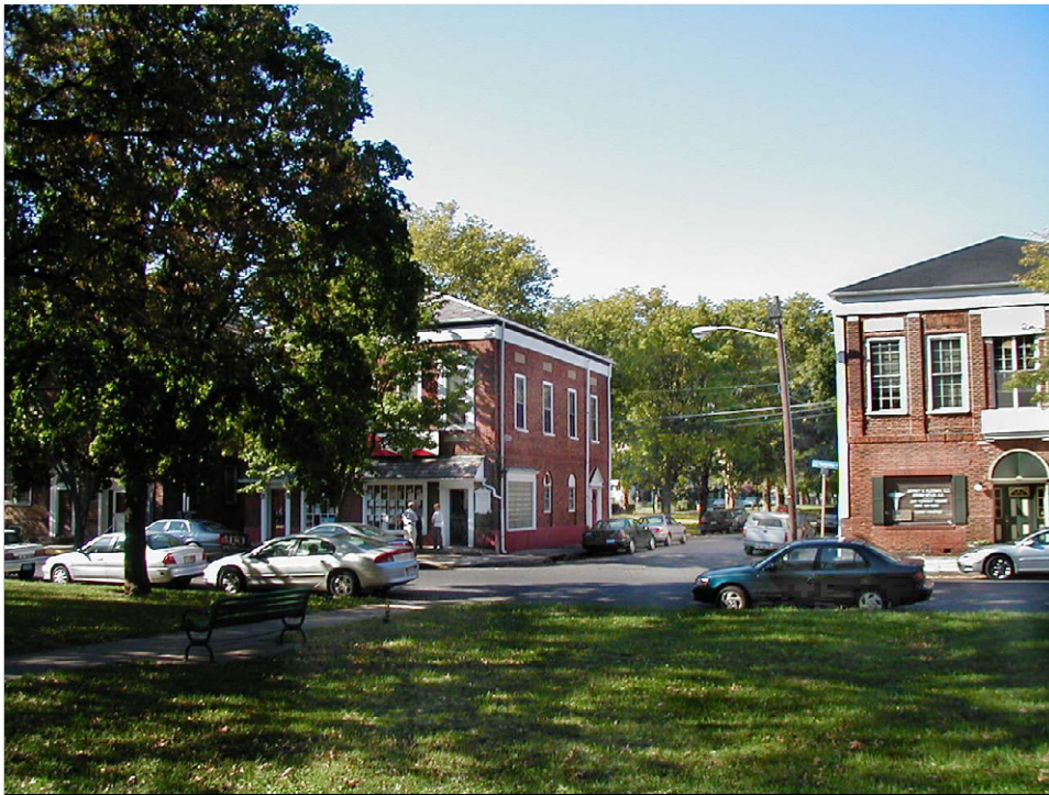
Figure 1. Viewing the street of the accident from Yorkship Square.

not commonly used in the United States over a generation ago in the early 1960s. Students can also be warned not to operate any kind of vehicle when they are angry.