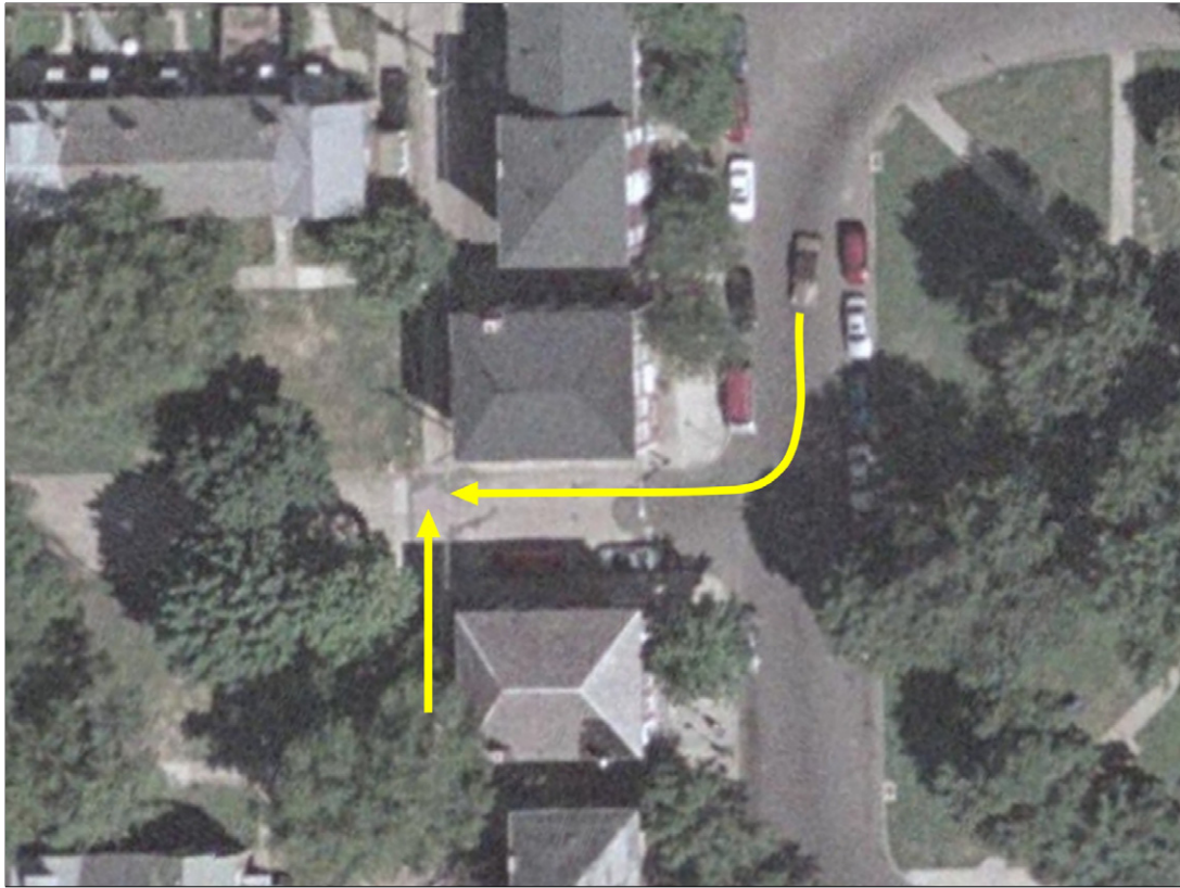
Figure 2. Aerial view of where the car hit the bicycle. Aerial image Courtesy GlobeExplorer.

information for the problem. However, our second approach will be more challenging. In real life, one usually knows with confidence the throw distance rather than the vault distance because the former is marked by where the pedestrian or cyclist finally comes to rest. Our second analysis will illustrate the power of physics as we work from the throw distance, using a model for the tumbling portion of the path.